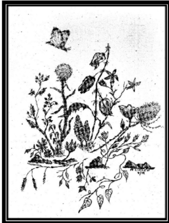
239 JOHN'S SKETCH 2-3-2023