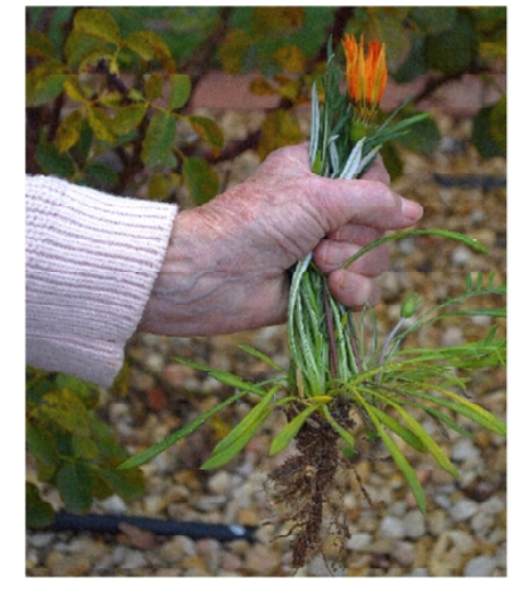
WEEDS AND US