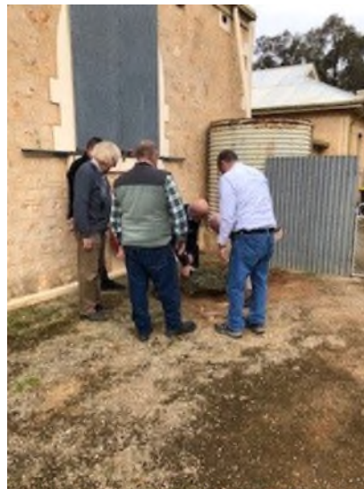
Placing the stone over the time capsule required much supervision