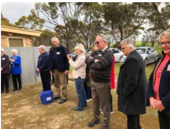
Some of those watching