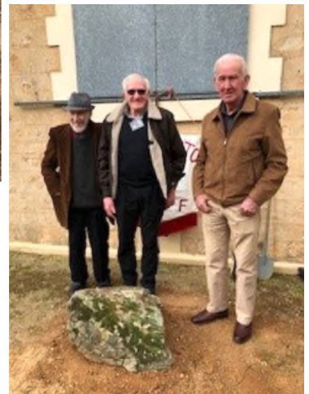
The elder statesmen admire the results