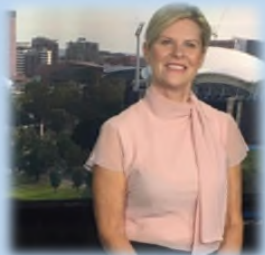
Terese Edwards CEO National Council for Single Mothers