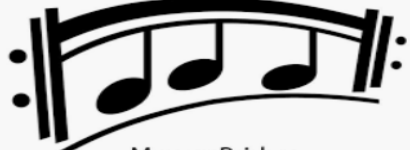
Murray Bridge Community Concert Band Inc.

For catering purposes please let the office know by Friday June 28 th if you intend to come.