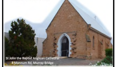
St John the Baptist Anglican Cathedral 8 Mannum Rd, Murray Bridge