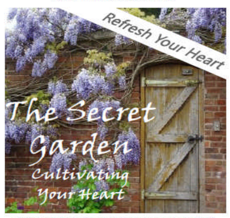
Brought to you by Our Saviour Lutheran Church

September 7th-9th, 2018 Adare House, Victor Harbor