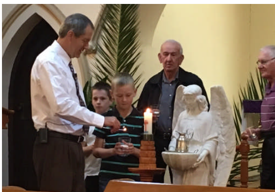
Monarto's Baptism Celebration

Bible Society - Leadership is donating $500 to the Bible Society. If you would also like to contribute please place in an envelope ear marked for the Bible Society and place with offerings or drop into the Church office.