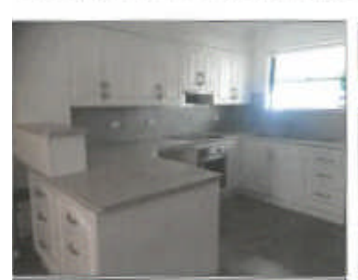
Unit 51 / Owl Drive Village

Or simply visit one of our villages and Delton or Tamara will show you around.