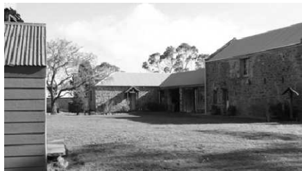
Glenbarr camp site at Strathalbyn with Cottages and Kitchen-mess Hall.