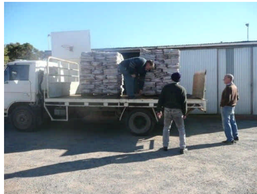
Another Load of Paper

Visitors Cards You will find these cards either on the pew or on the table as you enter church. We would like you to fill in the details and place in the offering bag or leave at the end of the pew.